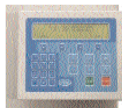
Machine Control Console